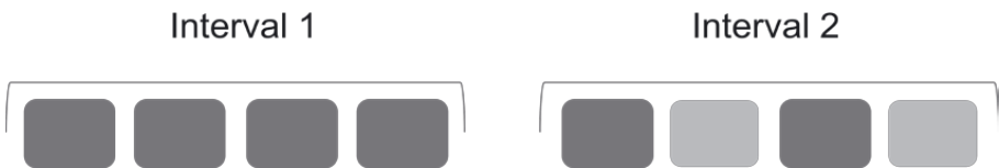
Fig. 1: The task for the participants was to choose the interval with fluctuating stimuli. The order of presentation was randomized for each trial. Test parameters for each test condition are adjustable and include the fundamental frequency ( F_0 ), center frequency ( F_c ), and harmonic.

The TFS1 test used in the study was similar to the test described in Moore and Søk (2009) 1 . The test paradigm is based on an A/B comparison of two sequences or intervals of stimuli: one where the F_0 harmonic is held constant in all presentations and one where every other stimulus is shifted by xF_0 (Fig. 1). The task is to select the sequence that contains the shifted stimuli. After each response, the participants get visual feedback whether the response is correct or incorrect.